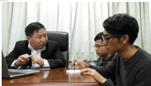
Figure 1 Comprehensive literacy

In society, the existence of cultural self-confidence has a certain complexity, it is also a diversified cultural concept and diverse ideological consciousness, it can independently judge the value connotation. In the context of rapid economic development, the influx of diversified ideas has brought great impact on the spread of traditional ideas in China. Cultural self-confidence can cultivate people's good moral quality, so ideological and political teachers in colleges and universities should actively integrate cultural self-confidence in practical teaching, enhance the flexibility of ideological and political education, and comprehensively enhance the comprehensive literacy of college students.