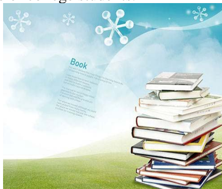
Figure 3 University students' cultural confidence

actively tell students the deeds of advanced civilization, carry out rich and diverse special education activities, and cultivate the patriotic and family-loving feelings of college students. College ideological and political teachers should constantly improve their own cultural accomplishment, give full play to the advantages of multimedia equipment, collect app, let students understand the cultural connotation at a deep level, help students to establish correct ideological consciousness, strengthen college students' identity to the excellent traditional culture of the Chinese nation, and strengthen the cultural confidence of college students.